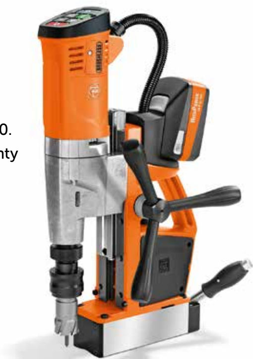
AKBU 35 PMQW SELECT