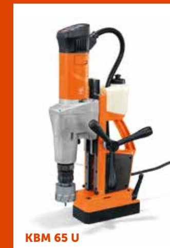
KBM 65 U