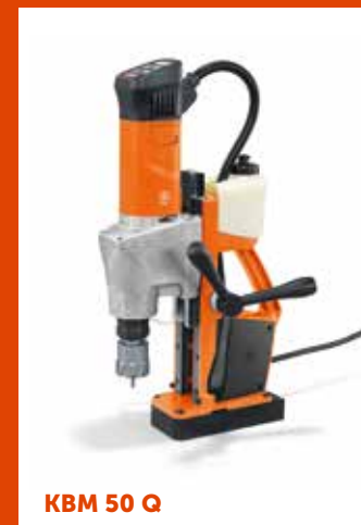
KBM 50 Q

Terms and conditions apply. Visit www.fein-uk.co.uk for full details.