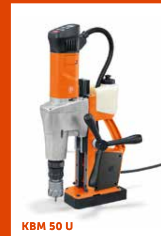
KBM 50 U