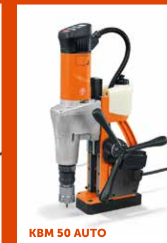
KBM 50 AUTO